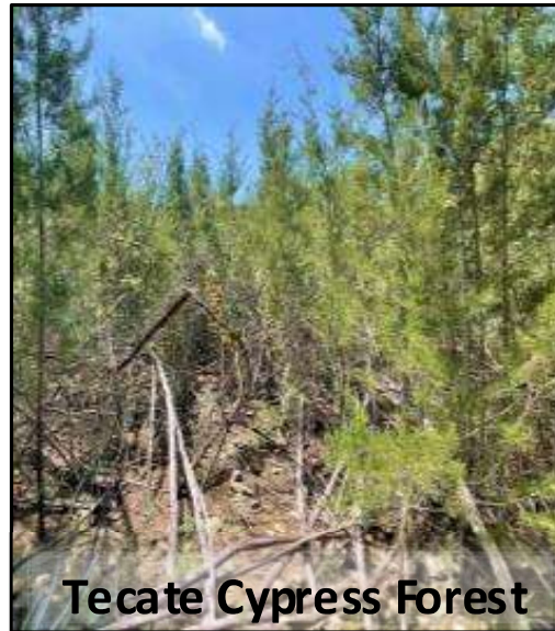
Tecate Cypress Forest