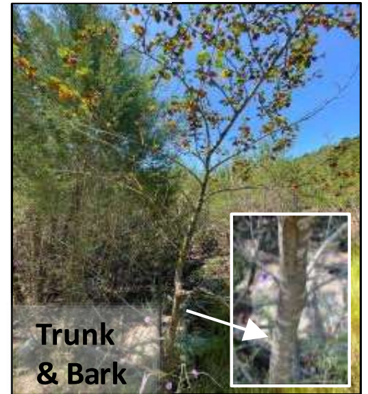
Trunk & Bark