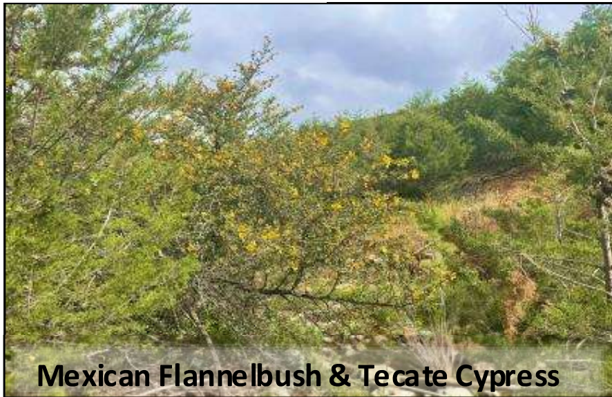
Mexican Flannelbush & Tecate Cypress